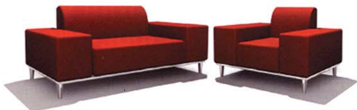
elle ts series